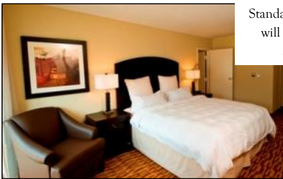
Standard, single room (double will have two queen beds) $89/night + taxes

Hotel Capstone will offer Alabama Museums Association a special rate of $89.00 for single or double, per room, per night for 25-30 rooms . Rates are subject to 15% City/State tax (lodging tax subject to change). Club Level/Concierge Floor - $25.00 Upgrade, Specialty King - $15.00 Upgrade. We will extend the group rate to your guests the day prior and/or the day following the conference arrival and departure dates, based upon availability.